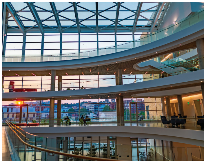
Tepper School of Business, Carnegie Mellon Innovation District, Pittsburgh, Pennsylvania

Post-crisis market dynamics should place a premium on downtowns and other parts of cities that have a broader mix of uses and activities, including innovation-oriented co-location of research institutions, mature companies, and start-ups and scale ups. In doing so, investors would be wise to examine the "good bones" of downtowns in secondary and tertiary cities that have not been the traditional focus of institutional investment. Investors should also track the flow of federal investments that are likely to leverage the distinctive competitive assets and advantages of these places. This will require a commitment to robust market analysis that captures the full growth potential of a broad, geographically diverse set of CBDs, and effectively reimagine the future of "downtown."