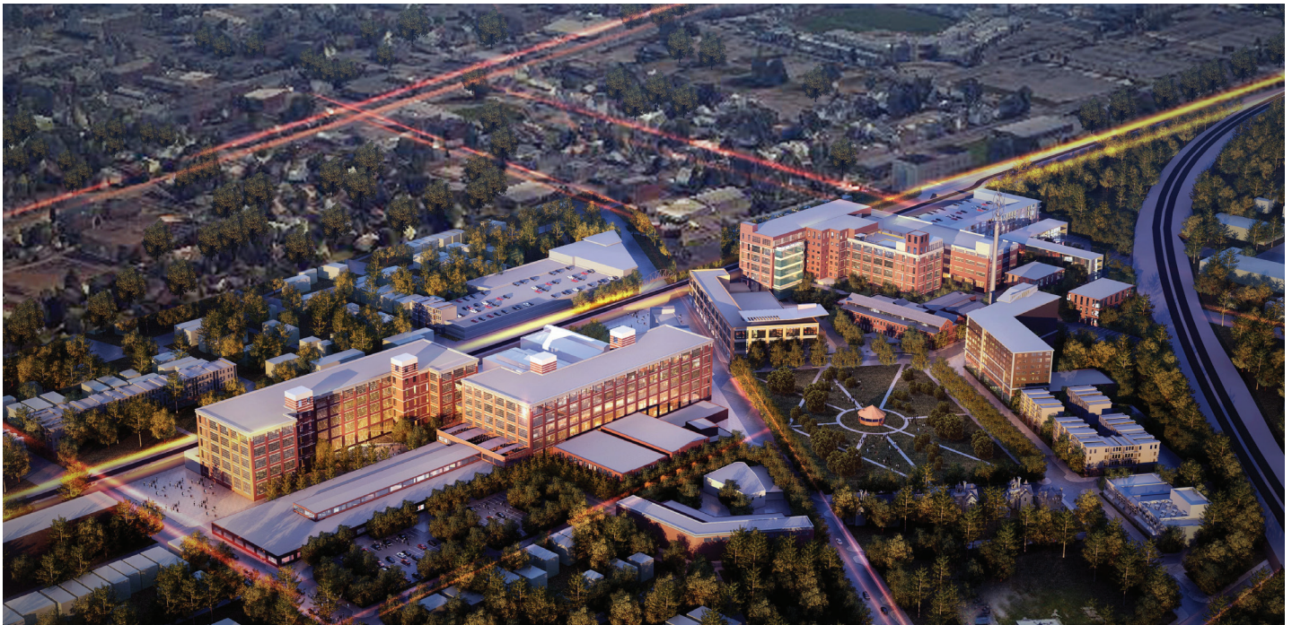
Electric Works, Fort Wayne, Indiana

Targeted public, philanthropic, corporate, and university investment has also played an enormous role in the transformation of downtowns over the decades. Dan Gilbert's decision to move Quicken Loans (and his family of companies) to the core of downtown Detroit in 2007 started a revival that continues to this day. Duke University is widely credited with acting as the stimulus for the rebirth of downtown Durham; the same can be said of Arizona State University in downtown Phoenix. Similar moves by local investors can be found in downtowns as disparate as Cincinnati, Cleveland, Erie, St. Louis, and Tampa. 5