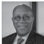
Ambassador Ron Kirk Former United States Trade Representative