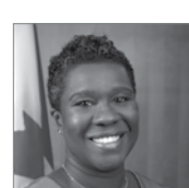
Nadia Theodore Consul General of Canada in Atlanta